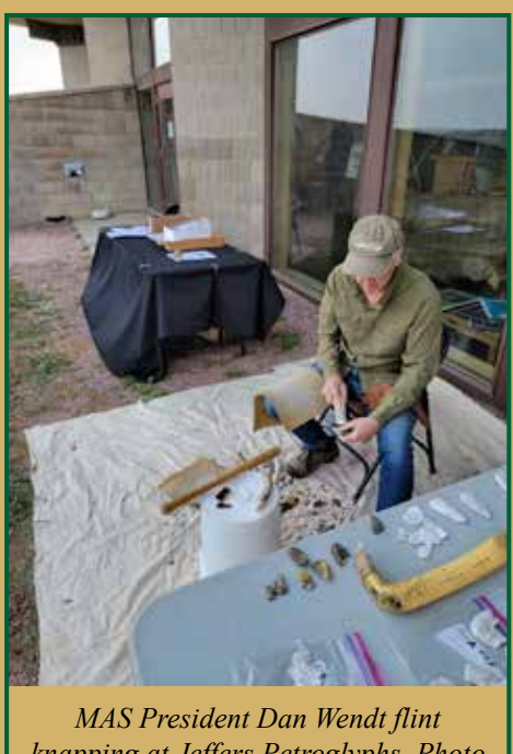
knapping at Jeffers Petroglyphs.

We also participated in Archaeology Day at Mille Lacs Kathio State Park (see page 7) The month wrapped up with our annual meeting, dinner, and lecture. See page 4 for a full recap! Even more events took place throughout the state than we were able to attend in 2023. We're already thinking about what this year will bring. Make sure to check our webpage and social media for announcements about Minnesota Archaeology Month 2024!